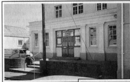
Left, Grosvenor Street Chapel in 1988, known as Bear Street Chapel in its early days.