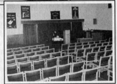
Right, the inside of Grosvenor Street Chapel in 1988 before it was sold.